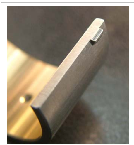
The racing notch allows an uninterrupted joint face